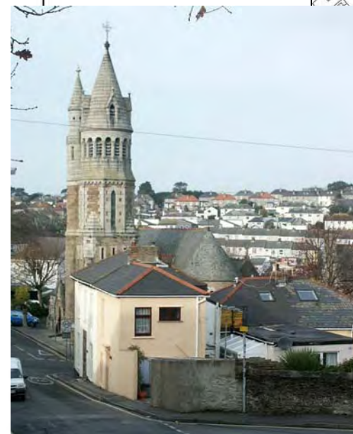
View to St Mary's Roman Catholic church from Lister Hill