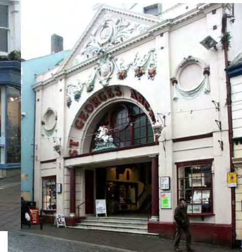
St George's Arcade, Church Street