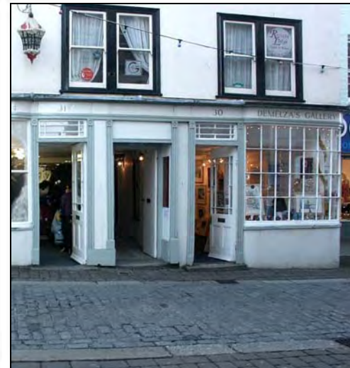
Shopfront, Church Street