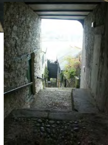
Ope, High Street