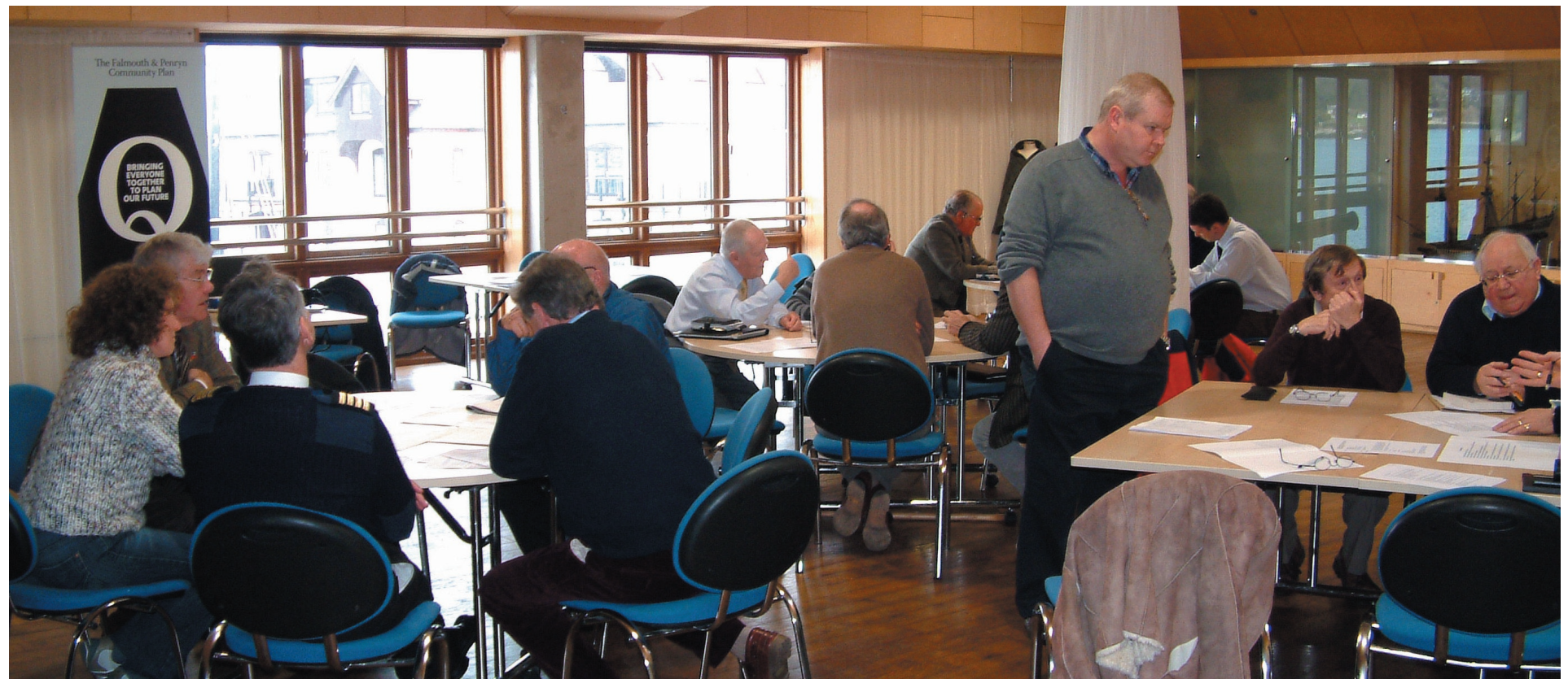
Maritime Topic Group Multiplier event at the National Maritime Museum, Falmouth

This process gave us the opportunity to then develop detailed, informed proposals to put to the communities of Falmouth and Penryn.