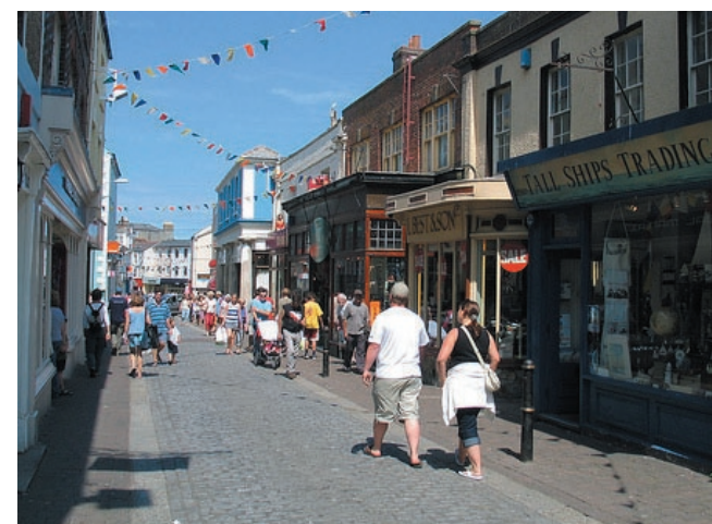
Church Street, Falmouth

Cornwall Council will continue to offer all the support it can to assist the local community as we move into the future. Over the coming months and years together we can strengthen relationships to find solutions to the challenges that will lay ahead'.