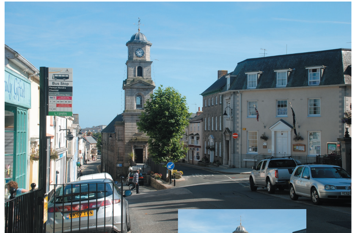
Lower and Upper Market Street, Penryn

Penryn Councillors hope that the process leads to a set of proposals and aspirations which the Town Council can use to see changes and improvements delivered which are actually requested by the community'.