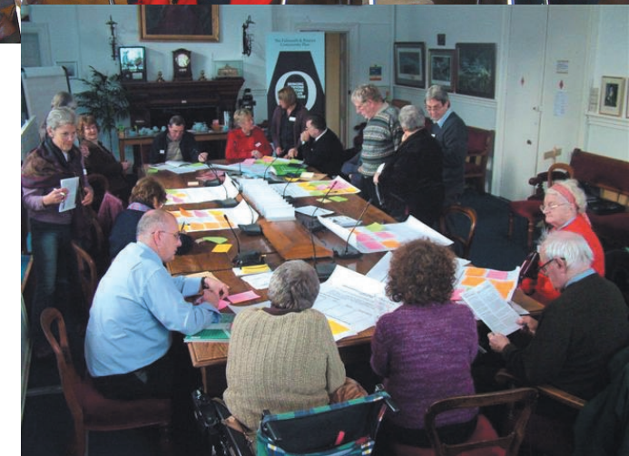
Health and Well-being Topic Group Multiplier event at Falmouth Town Council Chambers