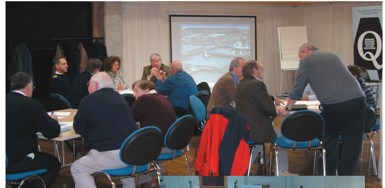
Maritime Topic Group Multiplier event at the National Maritime Museum, Falmouth

Chairman, Community Plan Management Group, October 2009