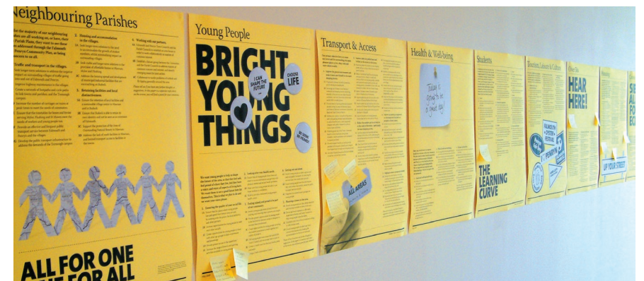
Drop-in Centre Falmouth