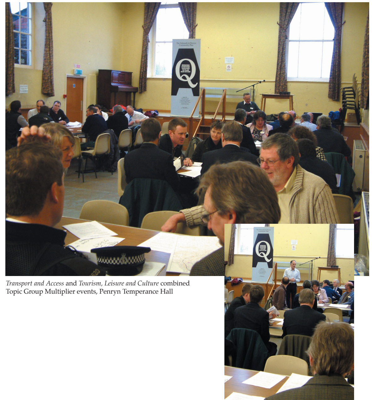
Transport and Access and Tourism, Leisure and Culture combined Topic Group Multiplier events, Penryn Temperance Hall

Housing Tourism, Leisure and Culture Transport and Access Health and Well-being Students Maritime Young People Crime and Safety Business and Economics Over 50s