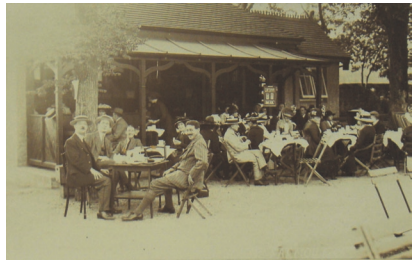
Unknown artist: cafe at Gyllingdune Garden, Princess Pavilion. Published as a postcard by E.A.Bragg.