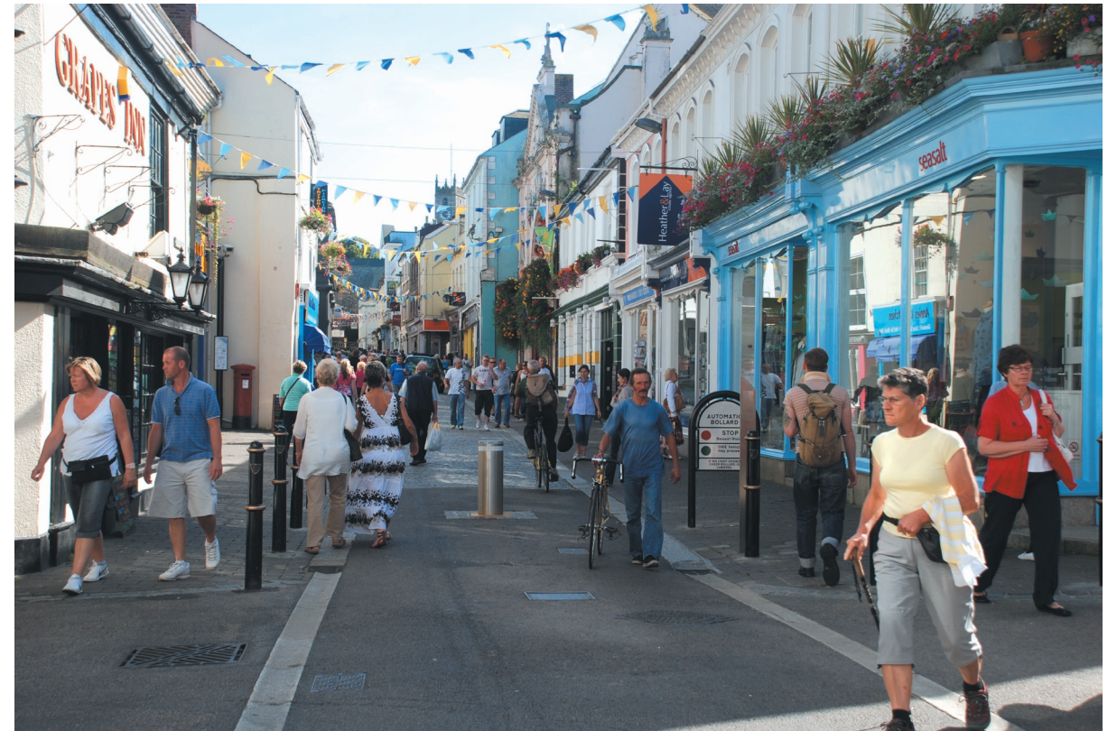
Church Street, Falmouth, showing the rising bollard

Planning work continues on how other, shopper friendly car parking can be provided and the Church Street car park closed for redevelopment, as proposed in the Community Plan. The town shuttle-bus service is proving increasingly popular with shoppers and this could help the case for using a Hoppa-bus as part of the shopper friendly parking solution. Once the rat-running is stopped the bollard will have reduced the traffic during the day by about 80%. Replacement of the parking in Church Street car park will remove most of the remaining 20%!